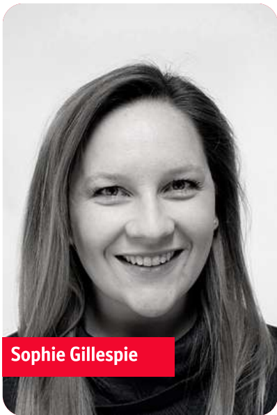
Conference Producer, WORKTECH Events