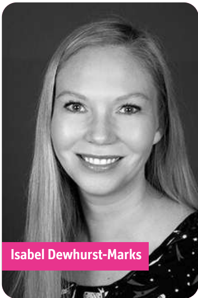
Managing Director, WORKTECH Events