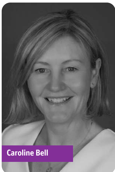
Managing Director, WORKTECH Events