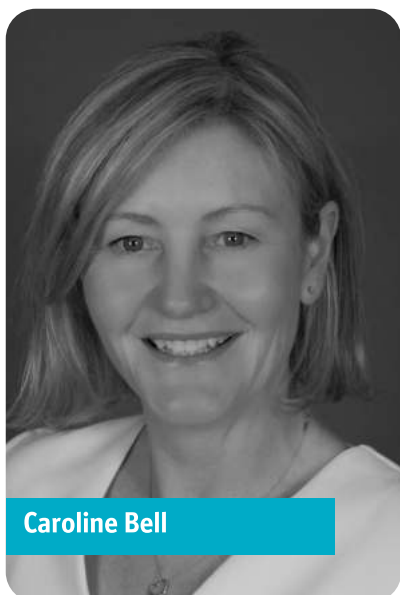
Managing Director, WORKTECH Events